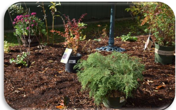
GARDEN HABITAT: FOOD, WATER, SHELTER & PLANTS