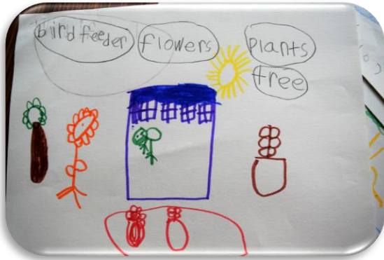
STUDENT REFLECTS ON GARDEN VISIT