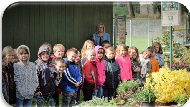
CLASSROOM VISIT TO THE GARDEN