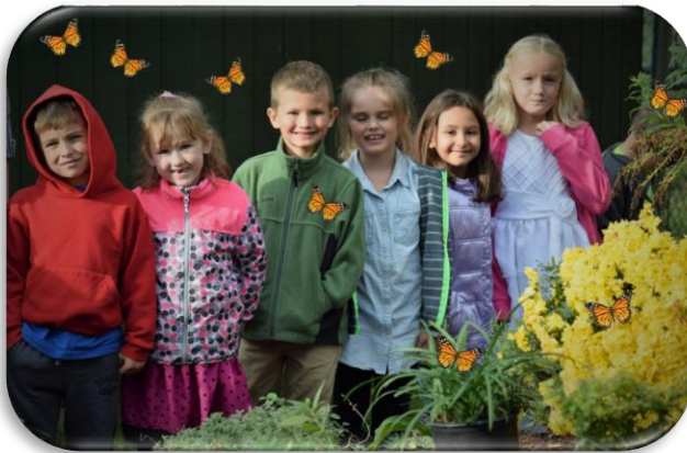
CHILDREN AT THE GARDEN