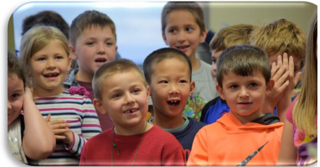
CHILDREN SINGING MONARCH SONG