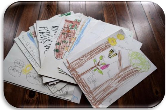
COLLECTION OF PICTURES FROM GARDEN VISIT