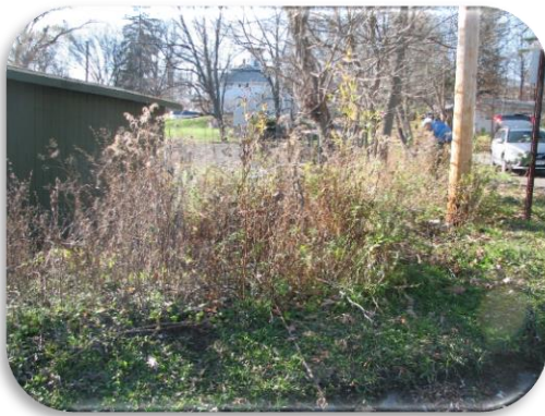
ORIGINAL GARDEN SPACE