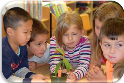
MONARCHS & MILKWEED IN CLASS