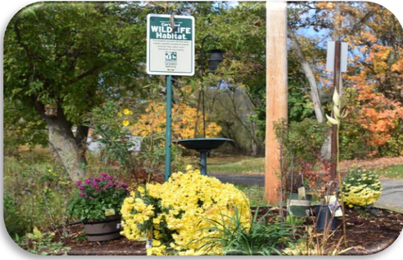
BLOOMS AT THE GARDEN