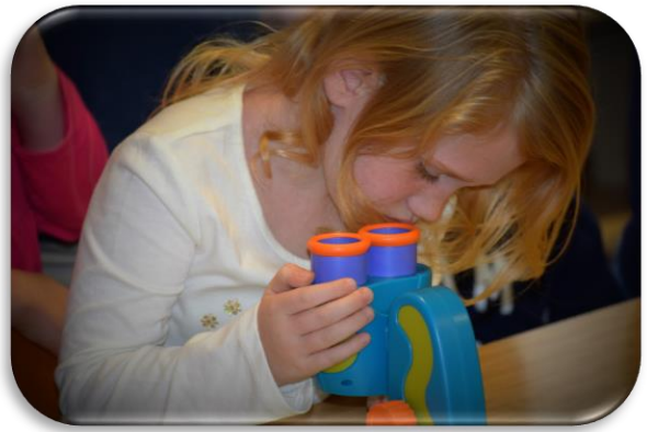
MONARCH CATERPILLAR: MICROSCOPE VIEW