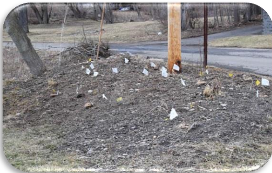
FLAGGED MARKERS OF PLANTINGS