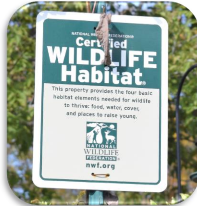
GARDEN CERTIFIED BY NWF AS WILDLIFE HABITAT