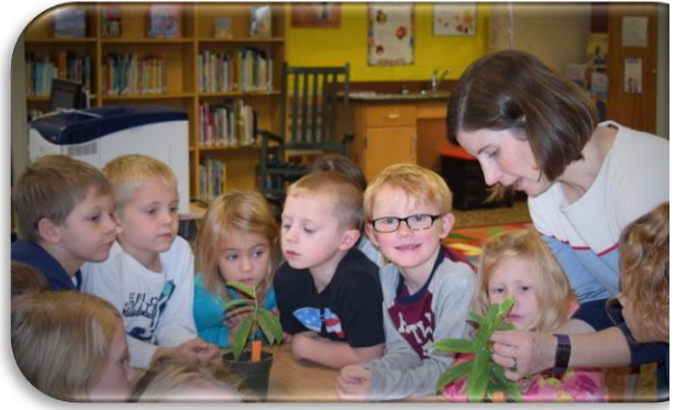
CORNELL BUTTERFLY LECTURE AT SCHOOL