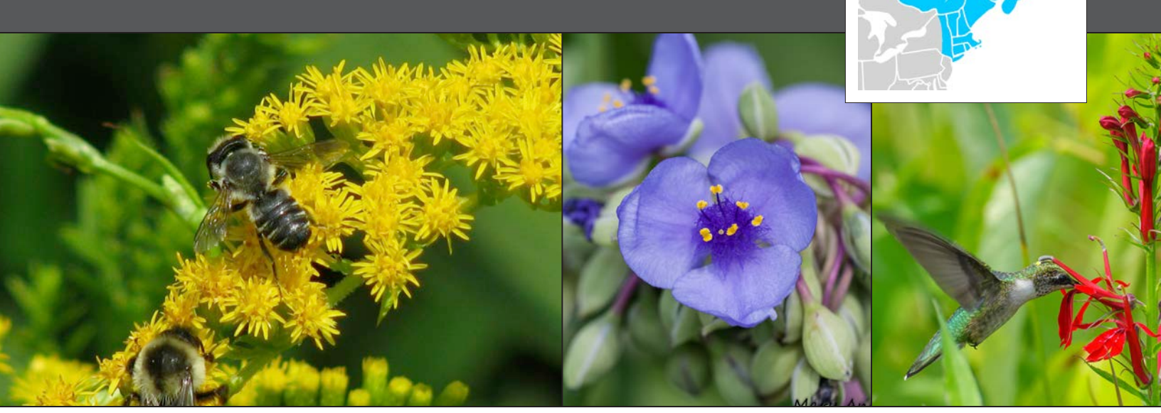
Wrinkleleaf goldenrod, spiderwort, and cardinal flower.

The Northeast Region encompasses southern Quebec, New Brunswick, Nova Scotia, the New England states, and eastern New York. High regional variation in topography, soils, and climate translates to tremendous ecological diversity, ranging from the coastal dunes and tidal ecosystems along the Atlantic shoreline, to the spectacularly species-rich deciduous forests and riparian communities of the Appalachian Highlands.